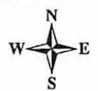
Image Date: 7/6/2010

Disclaimer: This document is produced using a Geographic Information System (GIS). The data contained herein is intended to be a graphical representation only and is by no means an official survey or legal interpretation thereof. The City of Coos Bay provides this data in good faith and makes no warranties, guarantees or representations of any kind, either expressed or implied, as to the content, accuracy, completeness or reliability of this data.